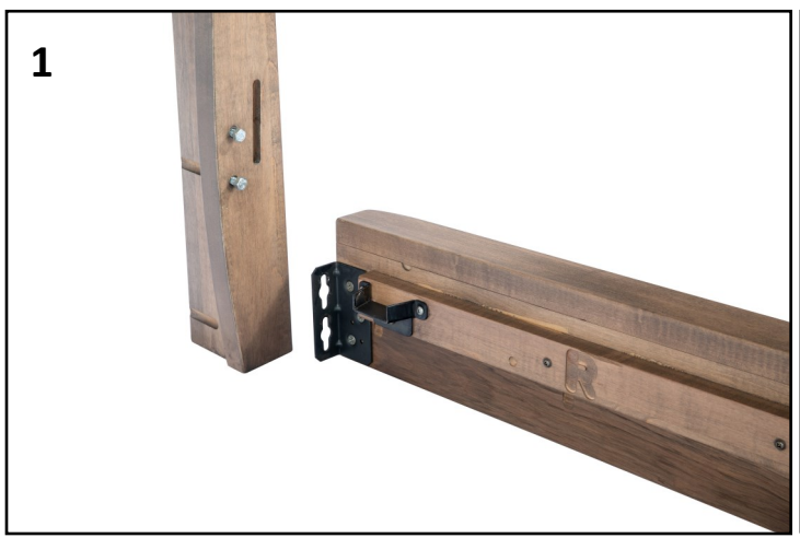
Locate headboard and side rail marked with R . Ensure bolts are present and bolt heads are backed out approximately 1/2".