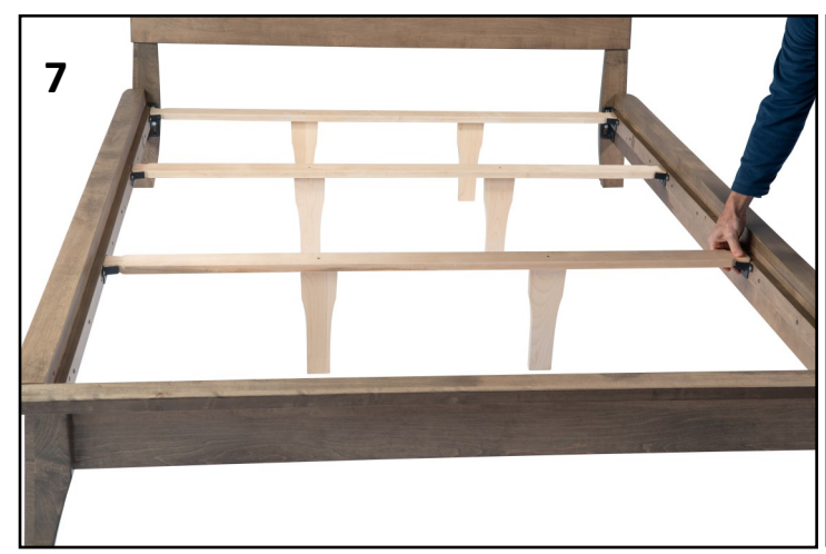
Bed will now appear as this. Slats are hold in position by dovetail brackets and are secure this way.