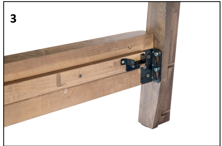
Locate siderail marked with L on left siderail and repeat process used for installing the right siderail onto headboard.