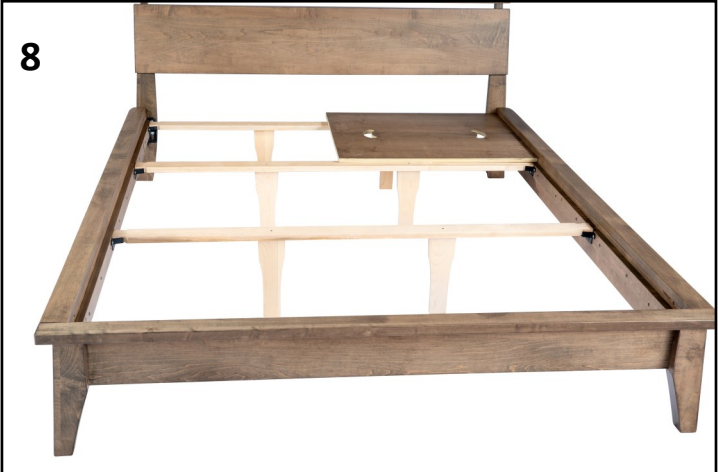
Place platform panels in this manner. Headboard, footboard and siderails will ensure location of panels.