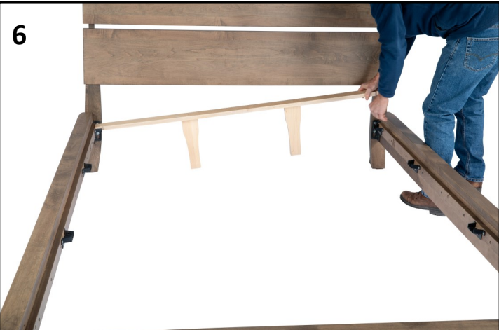
Simply place the ends of the bed slats into the dovetail brackets on the siderails.