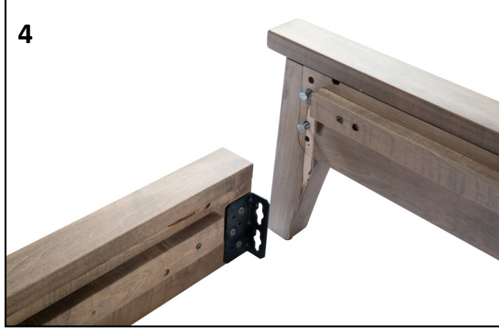
Bring footboard into position and attach both footboard siderail brackets using the same technique as used for installing headboard.