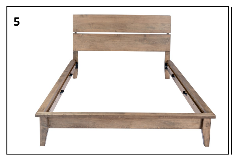
Tighten all eight bolts using 1/2" wrench or socket. Tighten snugly, but there is no need to over-tighten.