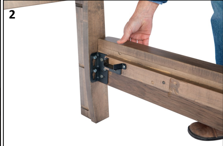
On right side of headboard, with R nearest to headboard, lift and position siderail bracket slots over bolt heads and lower into position.