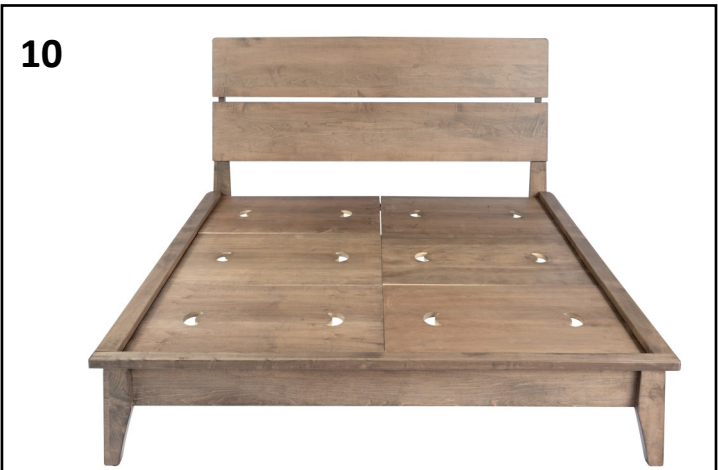
Bed in now fully assembled and ready for your mattress to be installed.