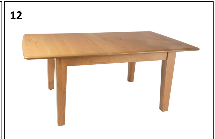
Table is now fully assembled and ready for many years of solid performance. Enjoy.

Remove foam packaging from folding leaf.