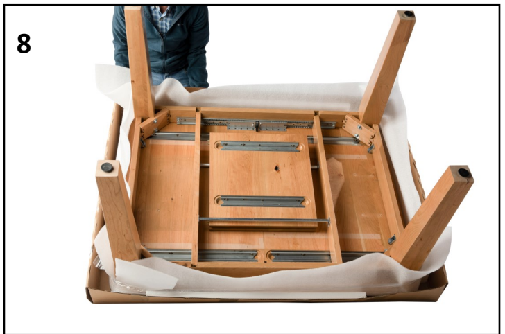
Table will now appear as this.